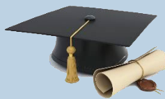
Education, ESL Classes & Digital Inclusion