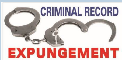
Background Record Expungement