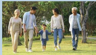
Elderly, Disabled, Youth, Family Services & Sustaining Services