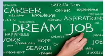
Career & Employment Readiness